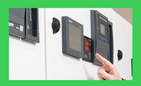
Learn more about EcoStruxure for Electricity Companies