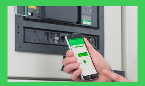
Unveiling MV switchgear powered by air and digital