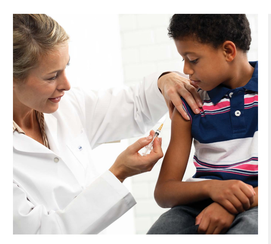
Schneider Electric Helps Sanofi Pasteur Achieve 30 Percent Increase in Overall Equipment Effectiveness

"The Schneider Electric solution has met all of Sanofi Pasteur's expectations by providing easy migration with the existing system, high availability and a secure architecture to store and manage all the facility's technical data."