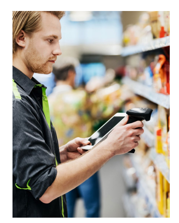
Let's engage in this journey!

Up to 99% quality data collection time Up to 75 % time reduction in compliance to regulations. Up to 97% quality control time reduction.