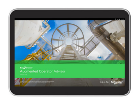
Troubleshoot & fix machines remotely