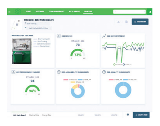
Monitor machines' performance & data