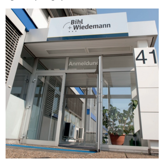
Bihl+Wiedemann headquarters, Mannheim, Germany

Since 2005 the company offers their customers solutions for personal and machine safety. These are also solutions with great savings in installation costs and maintenance, as well as minimizing the down-time of the machines while allowing a very high safety integrity level.