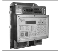
ADVC2 Protection relay