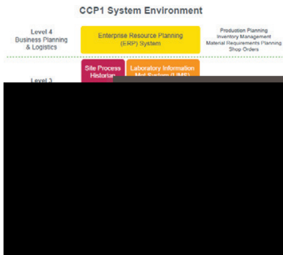
Figure 1 –CCP1 Manufacturing System Environment

Figure 1 illustrates the major computer systems and software applications that make up the CCP1 manufacturing system environment employing the Purdue Reference Model for Computer Integrated Manufacturing (CIM).