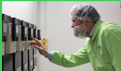
Redefining dairy efficiency with Fonterra