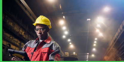
Discover EcoStruxure™ for Plant & Machine