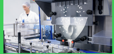
EcoStruxure™ for Food & Beverage Industry