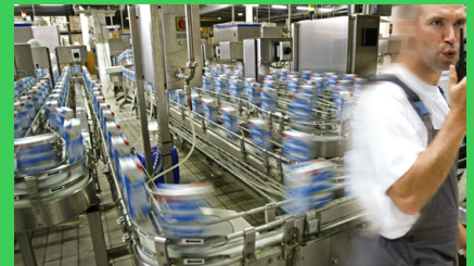
Significant savings in production, logistics, and inventory for F&N Dairies