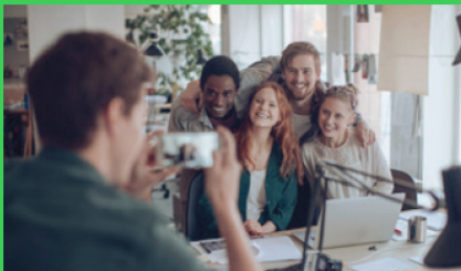
Contact us to start your journey