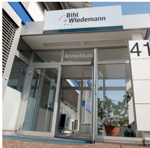
Bihl+Wiedemann headquarters, Mannheim, Germany

Since 2005 the company offers their customers solutions for personal and machine safety. These are also solutions with great savings in installation costs and maintenance, as well as minimizing the down-time of the machines while allowing a very high safety integrity level.