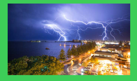
Smarter, faster power restoration