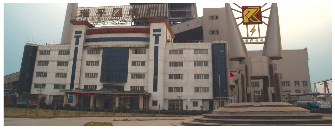
China's Ruiping Power Plant partnered with Schneider Electric to meet demanding energy-saving and emission-reduction targets.