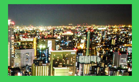
Discover Schneider Electric solution for Utilities